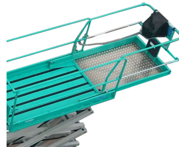
Manual deck extension of 59" 1100 lb Capacity (Stabilized) Number of Occupants - 4