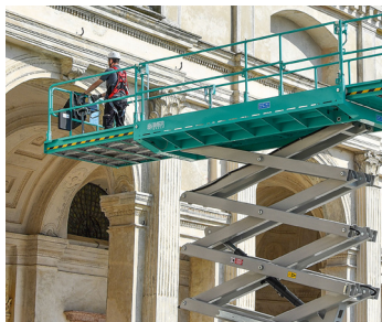
Driveable at full height and fully extended