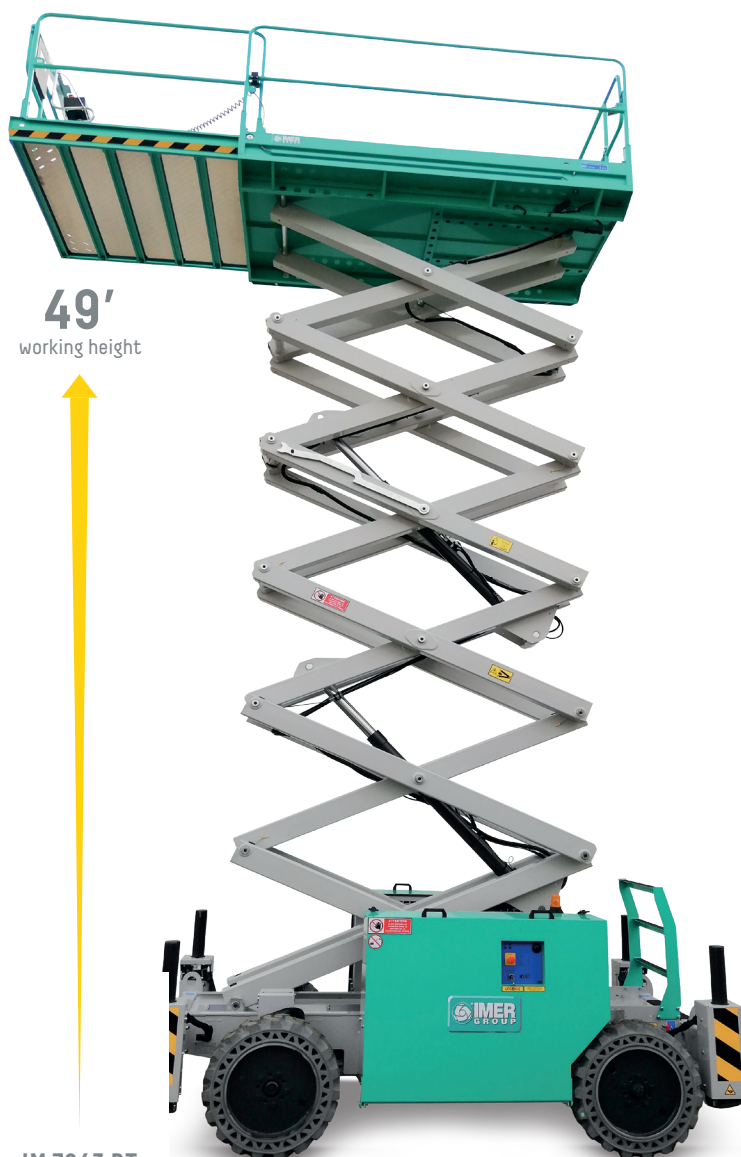
IM 7043 RT